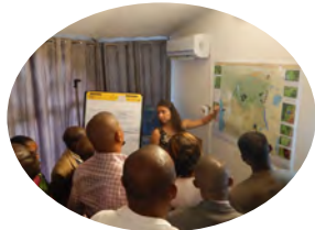
Workshop activities with law enforcement agencies