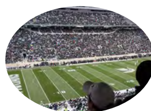
Spartans football game, Spartan Stadium