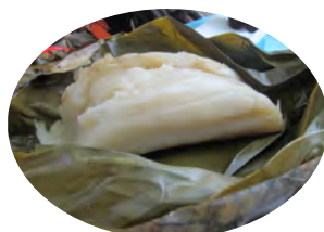
Manioc smoked in banana leaves

As part of my work there, I also went round different markets looking for bushmeat products. For a change of scenery, and to see some of the species we were working to protect, I visited the Bonobo Sanctuary in Kinshasa to learn more about the parallels of the illegal pet trade with that of bushmeat.