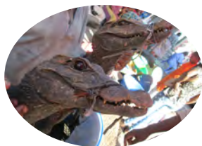
Live bushmeat found at the market