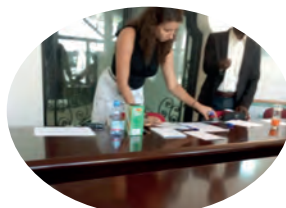
Focus group activities with restaurateurs