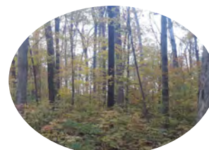
Red maple, oak and beech trees, Sanford Natural Area