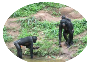
Lola ya Bonobo Sanctuary, Kinshasa DRC