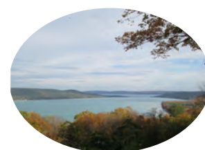
The Great Lakes of Michigan

Besides this, I also immersed myself in the many activities MSU has to offer by joining the Graduate Student Organisation and exploring the natural areas of Michigan. During my time, I attended a photography workshop, supported the Michigan State Spartans football and ice hockey teams, started re-learning French and took part in a GIS conference. I also found time to visit some of the big cities a short drive away such as Detroit and Chicago.