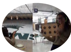
Indoor firearm range, Demmer Center