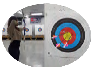
Archery training facility, Demmer Center